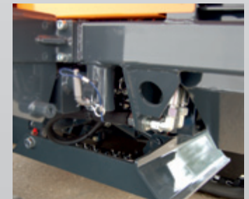
Option: support plate