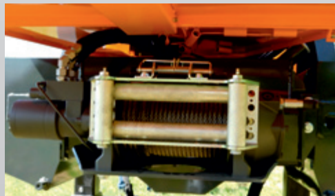
Option: hydraulic winch