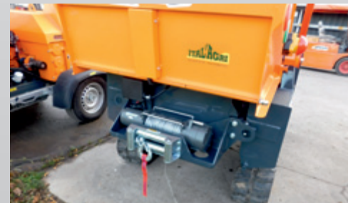
Option: electric winch