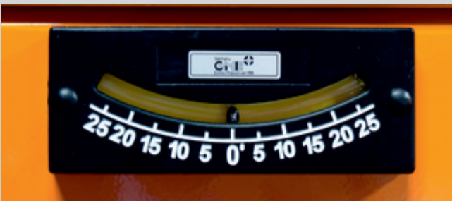
Scale for displaying the level compensation